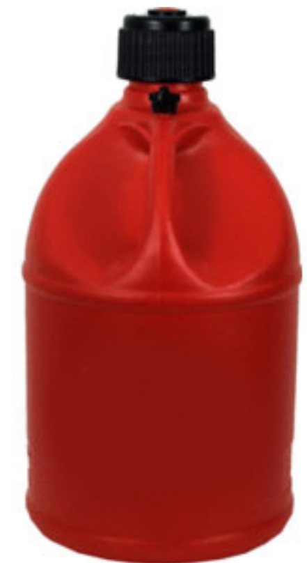
LEGAL CONTAINER REGARDLESS OF BRAND