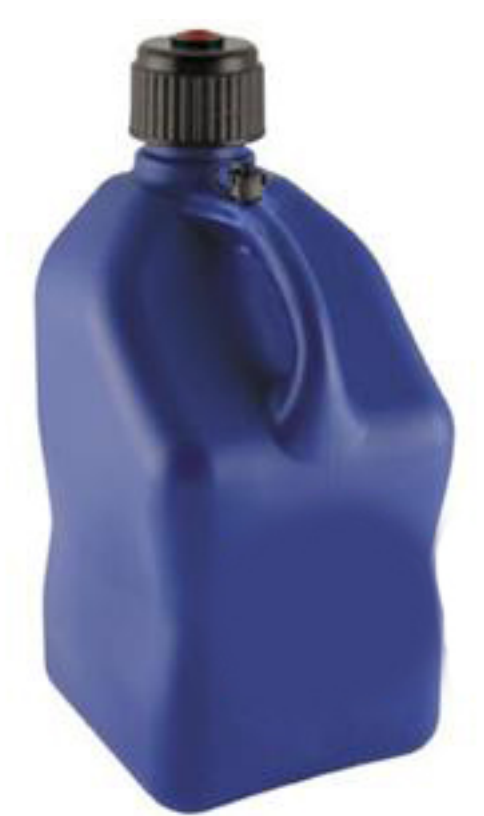
LEGAL CONTAINER REGARDLESS OF BRAND

NASA approved containers are limited to "5-gallon containers" shown below. These containers might hold slightly more than 5 gallons, as they come from the factory. Note- no modifications are permitted to increase the capacity of these cans.